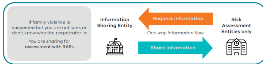
Figure 1: Overview of activities when sharing information for risk assessment

Family violence risk assessment is an ongoing process and is required at different points in time from different service perspectives. Education and care services will have a role in working collaboratively with other services to contribute to ongoing risk assessment and management of family violence.